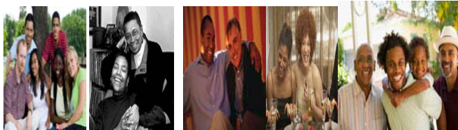
Black Lesbian and Gay (LG) Families Count in the Census 2010